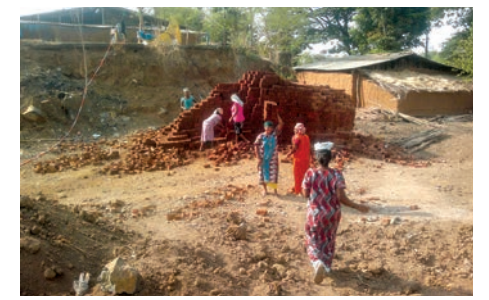
Villagers in Karad help with construction.