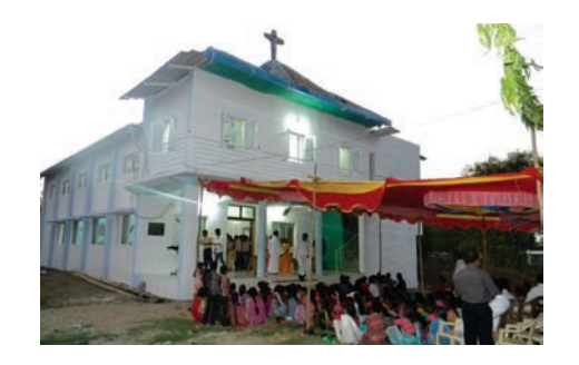
Completed\ center\ in\ Vasona.