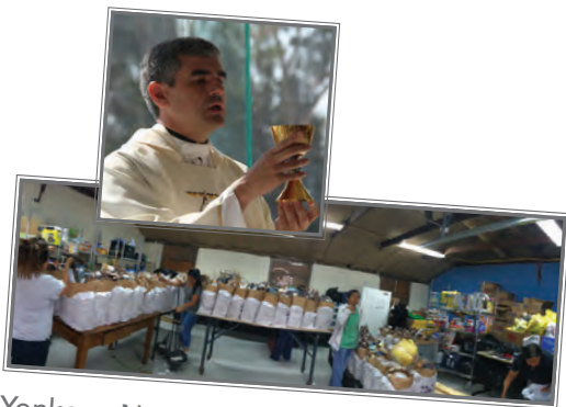
Yonkers, New York

Additionally, we helped rebuild schools and provided desks, chairs, and school supplies to non-Mano Amiga schools in the Philippines, Nigeria, Ghana, and Costa Rica.