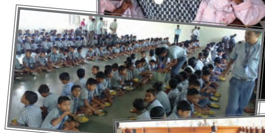
A place to eat in India and Ghana