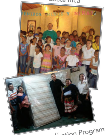
Beds for Evangelization Program