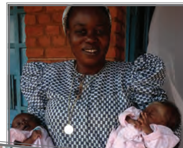
Ndekesha Orphanage, Congo

We will be rebuilding the orphanage soon to provide a safe and decent place for children to live. We still need assistance to furnish the orphanage with basic things such as beds, cribs, kitchen tables, etc. There are currently only two beds with 5 children sleeping per bed – the rest sleep on the floor.