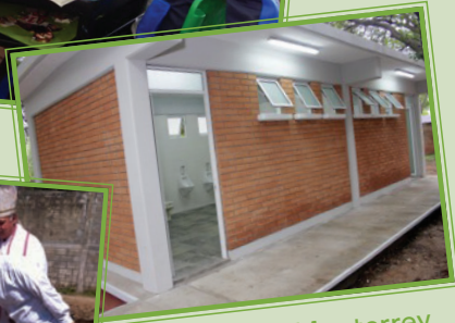
Mano Amiga Monterrey