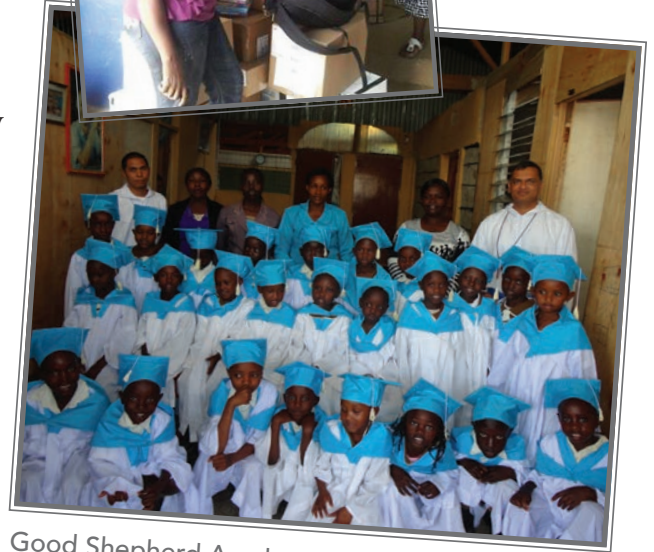
Good Shepherd Academy, Kenya