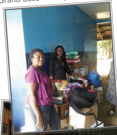
Grand Basa County, Liberia