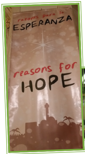
Saint Peter's, New York