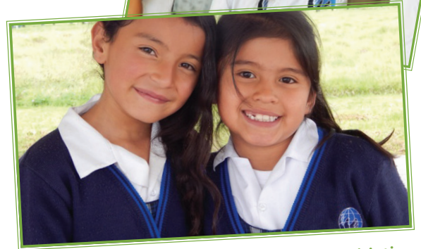
Colombia Scholarship Initiative