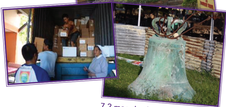
7.2 magnitude earthquake